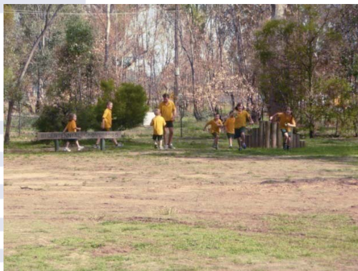
View of burnt area 5 months on

And of course back up frequently; you never know when we will need it.