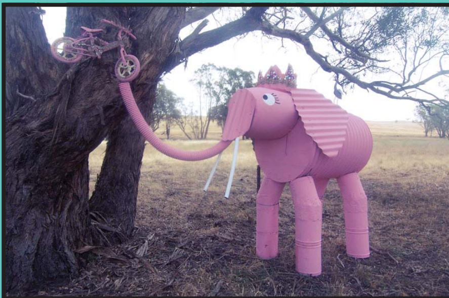
“Animals on Bikes” Paddock Art Sculptures